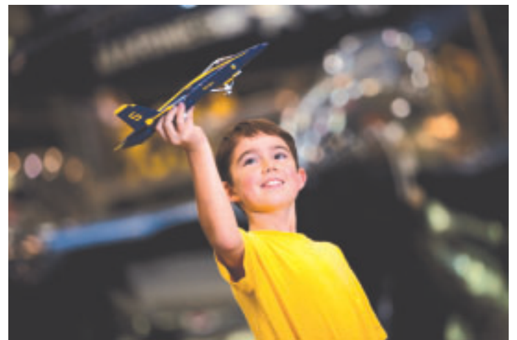
The National Naval Aviation Museum aboard NAS Pensacola is the largest museum of its kind in the United States.

After you leave the Memorial theater, linger in the museum! This historic treasure boasts more than 150 beautifully restored aircraft, hands-on exhibits and more than 4,000 artifacts representing Navy, Marine Corps and Coast Guard avia-