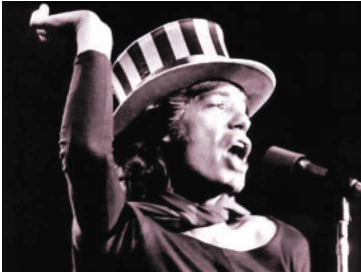
"The Rolling Stones: Gimme Shelter" documents the legendary rock band's 1969 American Tour.

"Mystery Science Theater 3000: XVI" (Limited Edition) — Fans of the show will definitely want to grab this boxed set, as it comes with a Tom Servo figurine, lobby cards and a whole slew of awesome extra features. The four episodes featured in this boxed set are: "The Corpse Vanishes" (along with a Commando Cody short), "Warrior of the Lost World," Roger Corman's "Night of the Blood Beast," and finally a bizarre Mexican Christmas film, "Santa Claus," wherein Santa lives on a cloud in outer space and is assisted