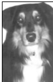
LICENSED - INSURED